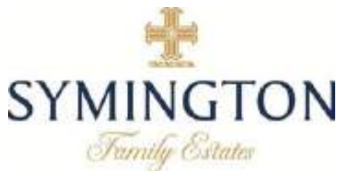
Table 27 PORT